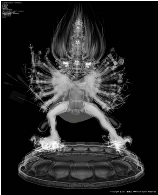
Core of Wrathful King Kong (X Ray Mode) + Core of Wrathful King Kong (Anger Brain Pathway)