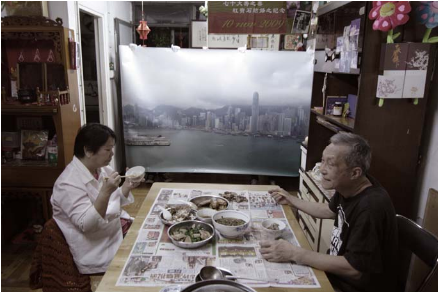
Gift (I): Invincible Sea View