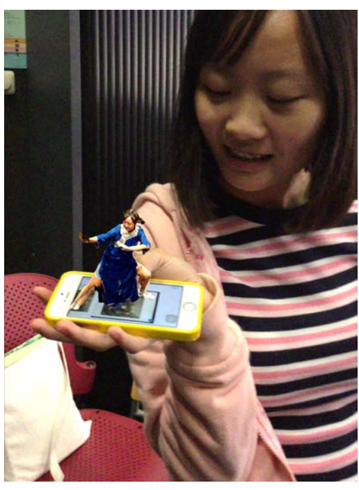
Workshop with CityU and HKAPA students

Fujihata took references from photographs of Hong Kong from the 1940s to the 1970s. In order to better understand the meaning behind each image, the artist conducted further research through oral interviews with local and elderly residents. Based on their stories, Fujihata directed actors to reimagine and recreate the scenes by using photogrammetry with 70 interlinked cameras in the studio. Snapshots are then transformed into 3D data.