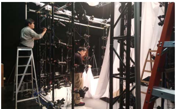
Photogrammetry Shooting Setup