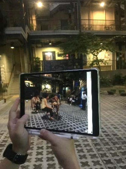
Compose \ scenes \ of \ the \ two \ realities \ with \ augmented \ reality; \ Courtesy \ of \ Viva \ Blue \ House, \ St. \ James' \ Settlement