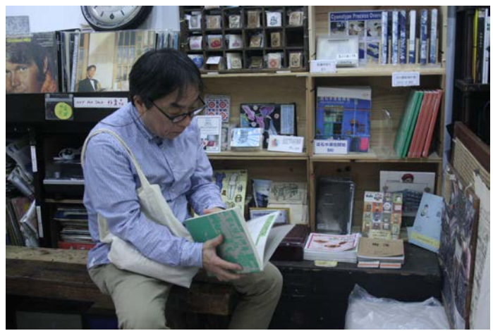
Visit to Hong Kong House of Stories, Blue House

This is not a conventional physical monument like a statue, a building or a bridge, but a new kind of monument: a memory-as-monument. This snapshot moment of the 3D figures is presented in cyberspace and shared by the community in the real space.